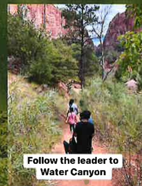
Follow the leader to Water Canyon