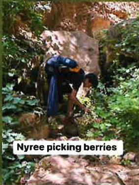
Nyree picking berries