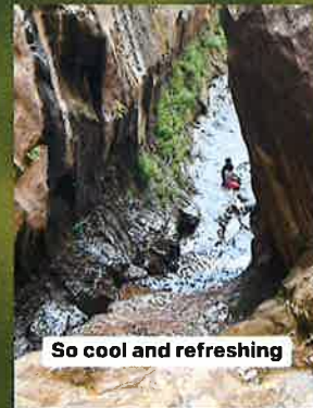
So cool and refreshing