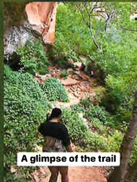
A glimpse of the trail