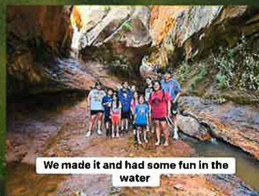
We made it and had some fun in the water