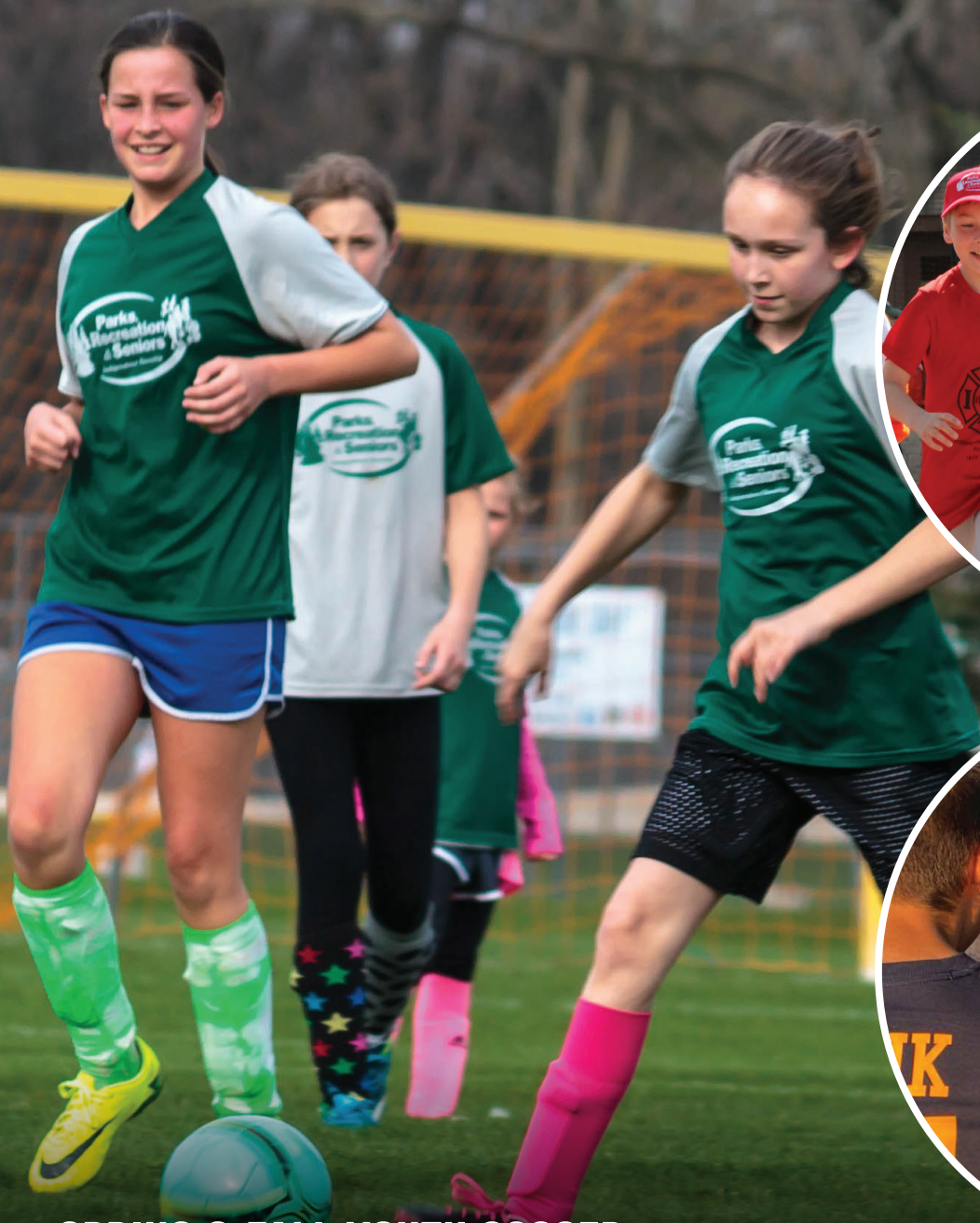
SPRING & FALL YOUTH SOCCER

INDEPENDENCE TOWNSHIP PARKS, RECREATION & SENIORS