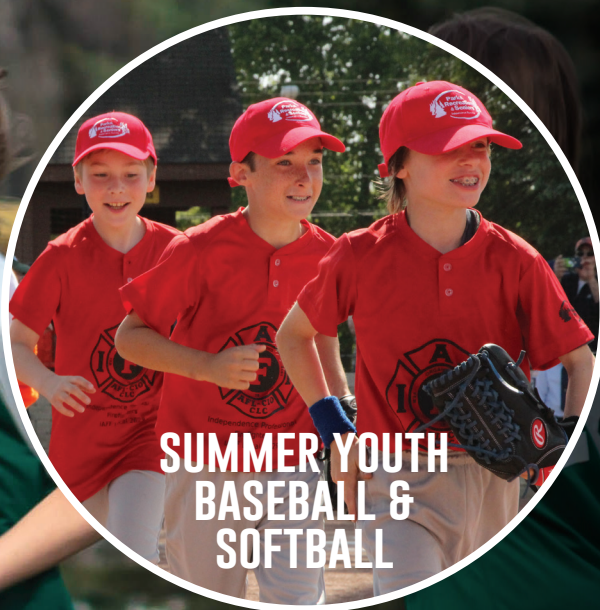
SUMMER YOUTH BASEBALL & SOFTBALL