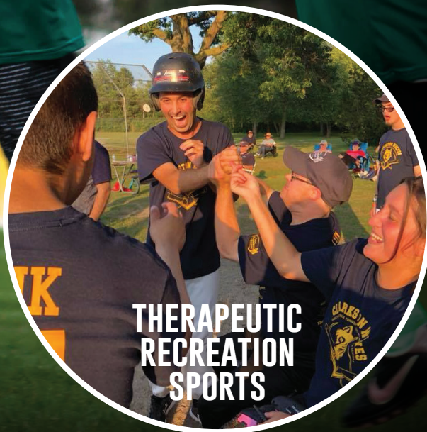
THERAPEUTIC RECREATION SPORTS