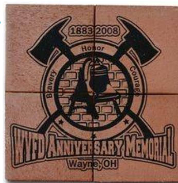
SAMPLE: 16" X 16" COLOR: WHEATSFIELD