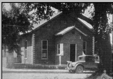
The Moore Clinic