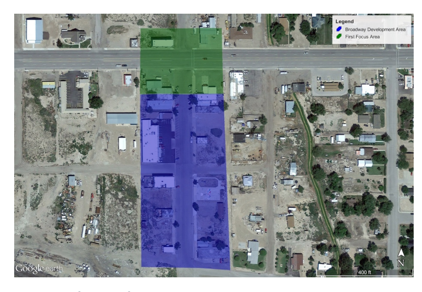
Map 3: Broadway Development Area

The challenge facing the historic downtown is that development momentum, and vehicle traffic, is concentrated on either end of the City near the freeway interchanges. The commercial activity that formerly anchored the downtown has shifted, leaving only a small version of what used to stand. However, there are some positive things in the downtown which will serve as the building blocks for new development. Specifically, Ray's brings a steady stream of visitors to the corner, and the addition of the Savage Territory art gallery creates additional vibrancy while the Melon Vine grocery store ensures consistent traffic from local residents. In order for a redevelopment effort within the historic downtown to succeed in the long run, it needs to focus on offering an experience that is unique from the commercial activity that is occurring at the freeway interchanges.