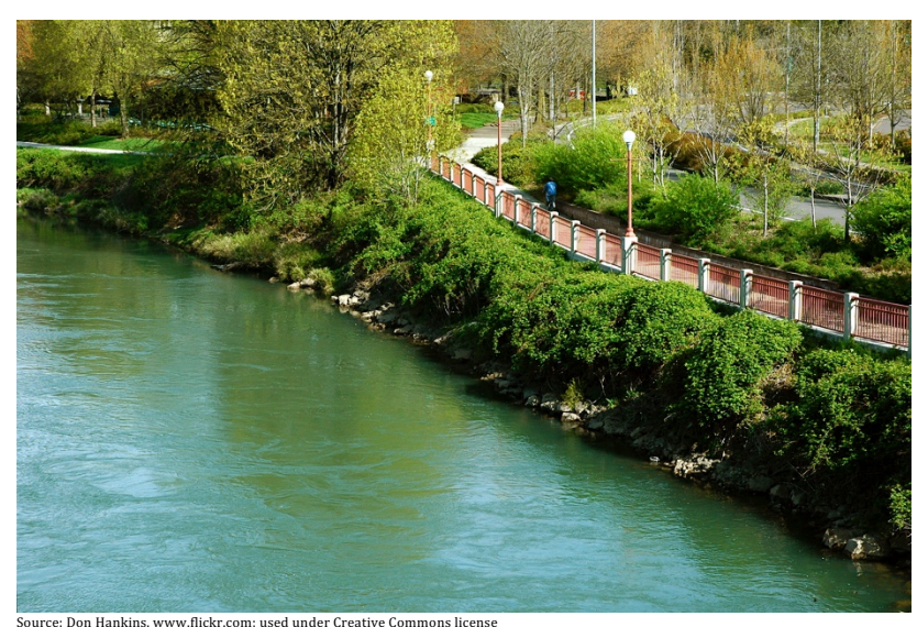
Figure 4: River Development Concepts - Walkable Trails

New, official meeting space should be included as part of the riverfront development efforts. The City is centrally located within southeastern Utah and is a natural meeting location for Federal and State government organizations, and business groups. The Museum currently hosts dozens of groups each year utilizing space that is intended for other purposes. The appeal of Green River as a meeting location would be even greater if a small conference center were built to specifically accommodate these types of groups and utilized a location along the river with access trails to the riverfront. Such a location and design would have the potential to be a competitive location for industry and commercial conferences. The conference space should be viewed and utilized as a way to help stabilize the seasonality of the community. For this to occur, groups and organizations will need to be targeted and recruited to hold meetings and events during non-peak times of the year.