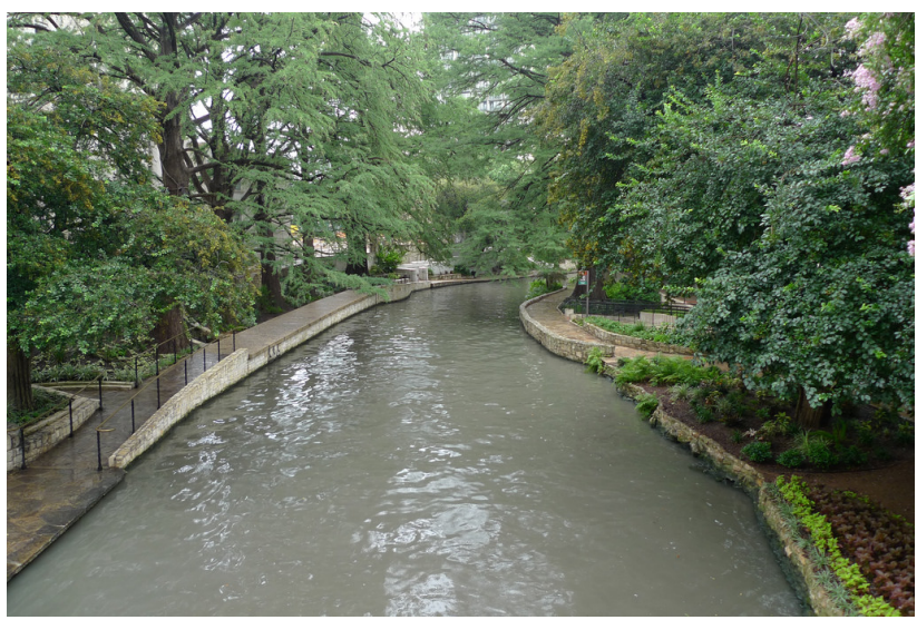
Figure 2: River Development Concepts - Riverfront Park Benches