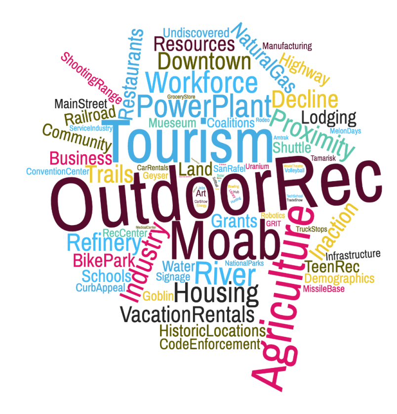
Figure 1: Interview Word Cloud

The rest of this page left blank intentionally