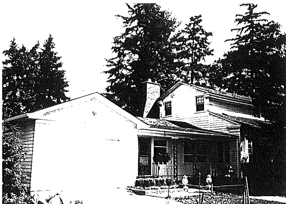
Roll 2, Neg. 0- South and west elevations, facing northeast