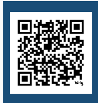
City of Franklin Electric Aggregation Rate Performance

The City has negotiated a new agreement with Energy Harbor to serve as the electric aggregation supplier beginning in May 2024 for an 18-month term. The best available market rate for the program is $0.0631/kWh compared to Duke Energy's rate of $0.097/kWh currently.