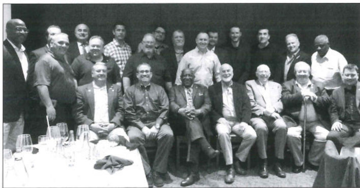
Pictured above are many of Joint Meeting's employees and retirees at the NJWEA Annual Conference and Exposition.