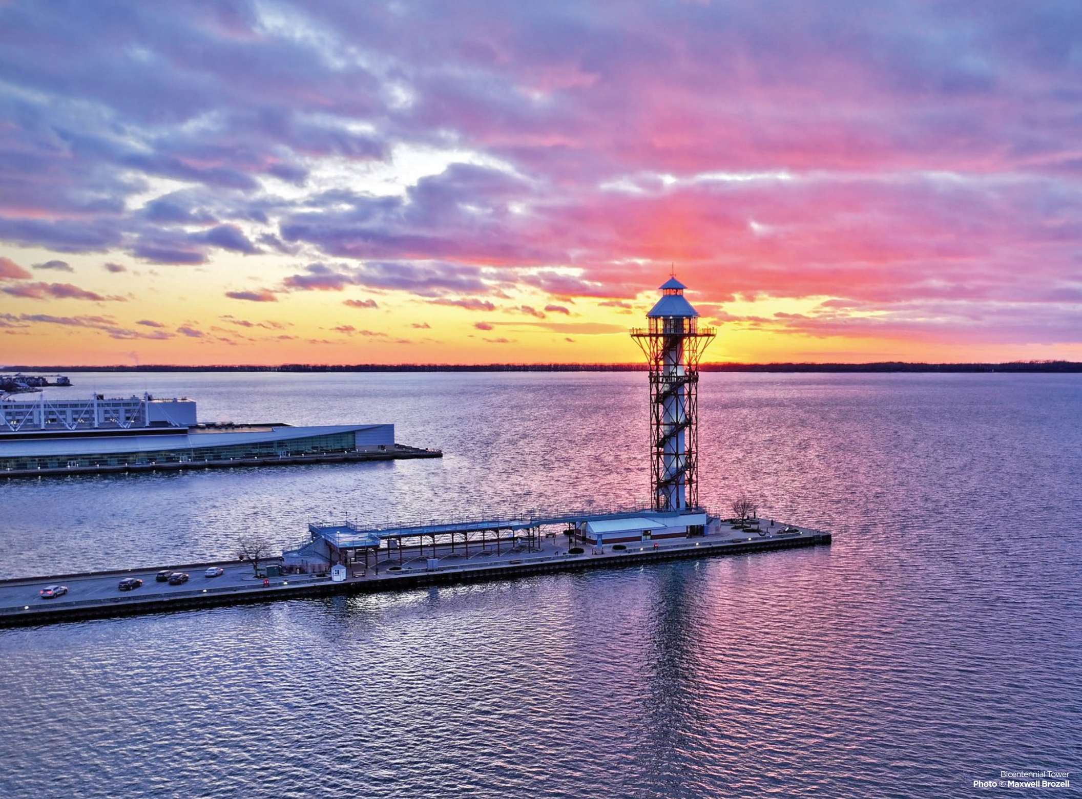
Bicentennial Tower

Don't know who to call at City Hall? Citizen Response Center: (814) 870-1111