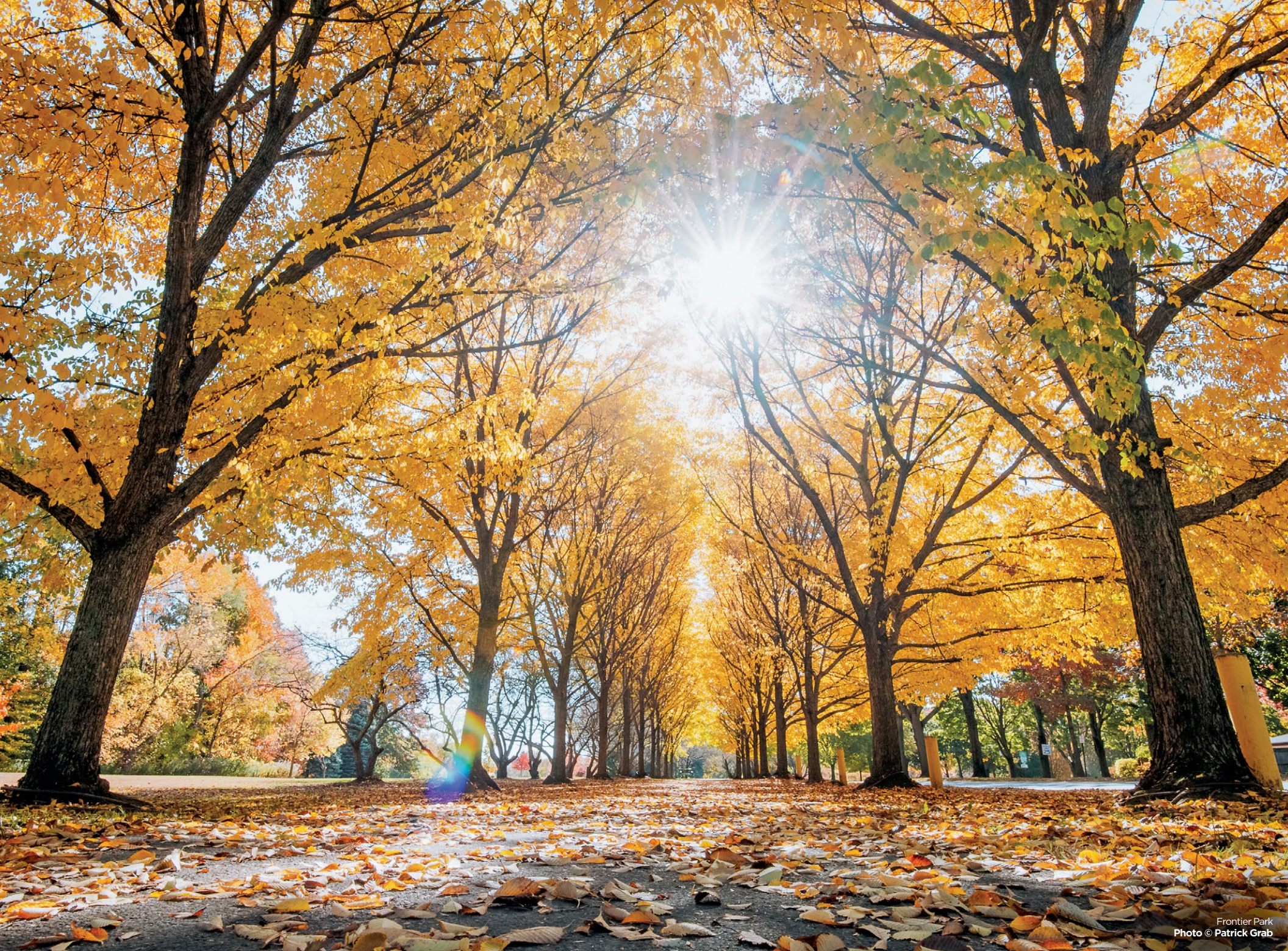
Frontier Park

Don't know who to call at City Hall? Citizen Response Center: (814) 870-1111