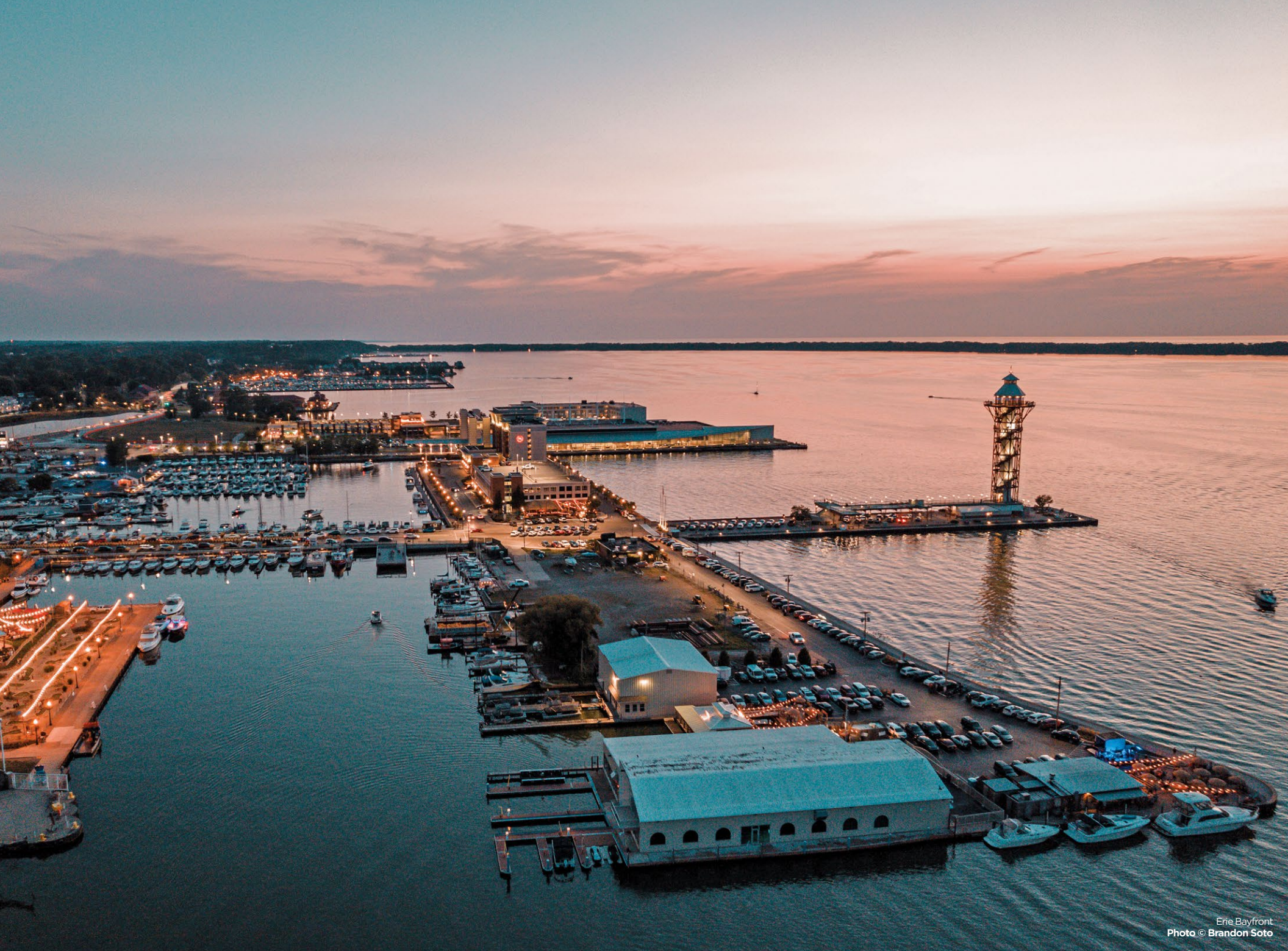
Erie Bayfront

Don't know who to call at City Hall? Citizen Response Center: (814) 870-1111