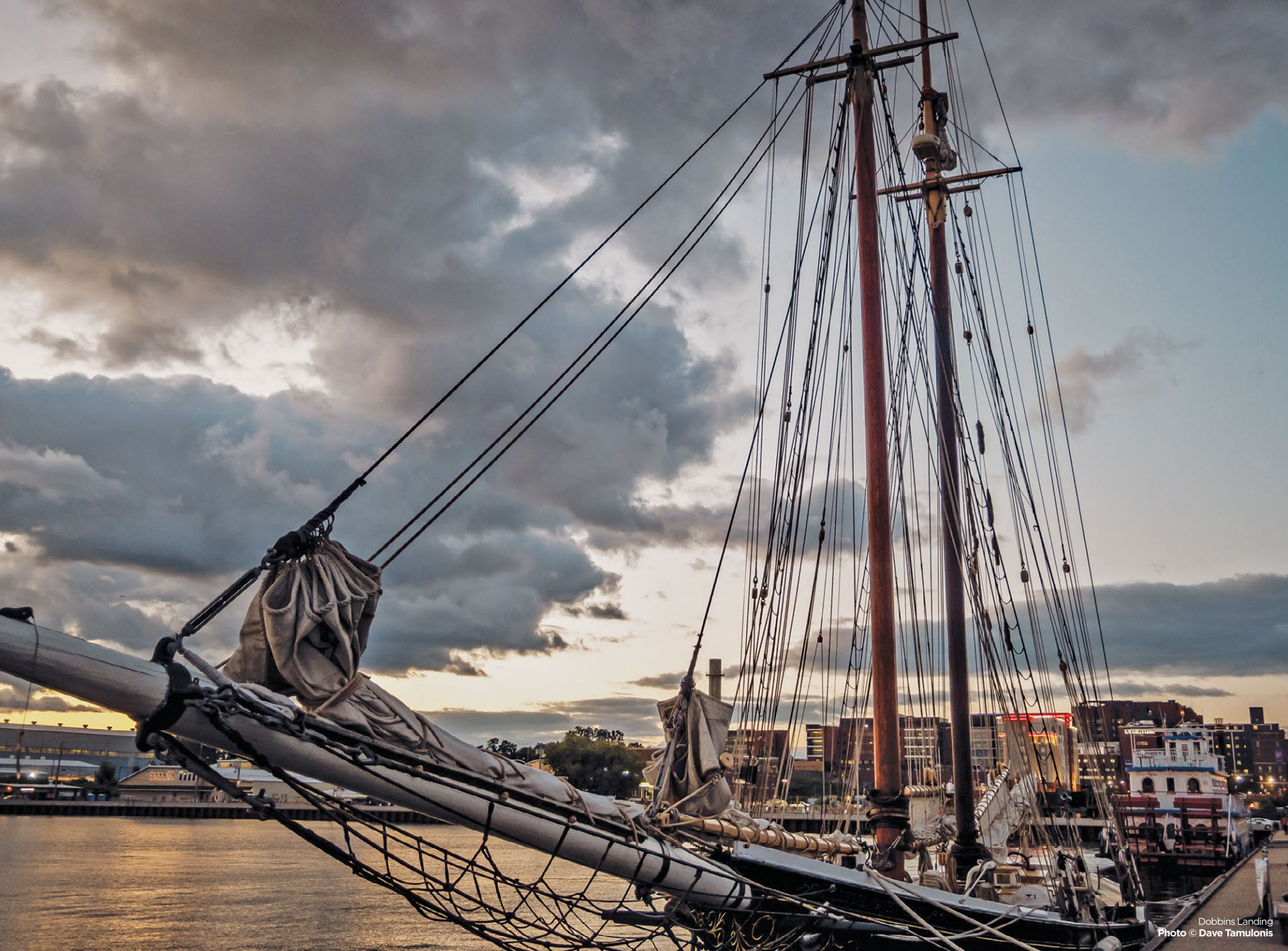
Dobbins Landing

Don't know who to call at City Hall? Citizen Response Center: (814) 870-1111