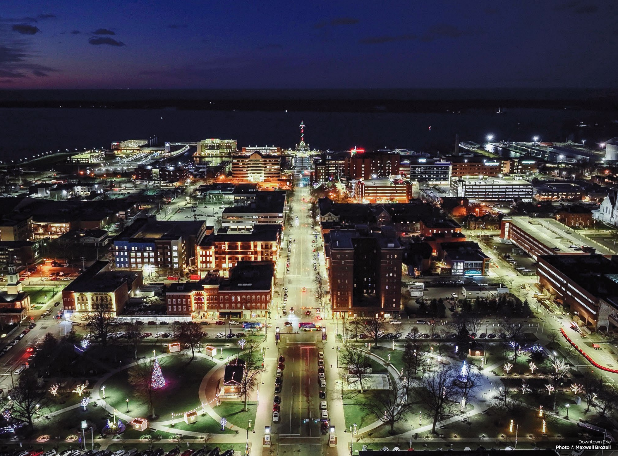
Downtown Erie

Don't know who to call at City Hall? Citizen Response Center: (814) 870-1111