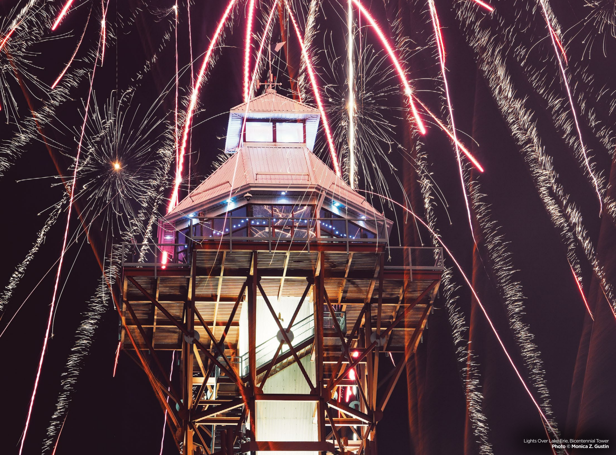
Lights Over Lake Erie, Bicentennial Tower

Don't know who to call at City Hall? Citizen Response Center: (814) 870-1111