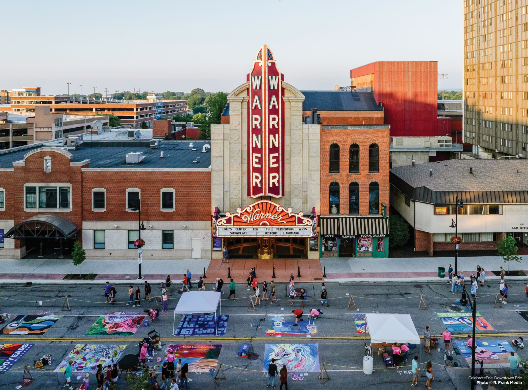
CelebrateErie, Downtown Erie

Don't know who to call at City Hall? Citizen Response Center: (814) 870-1111