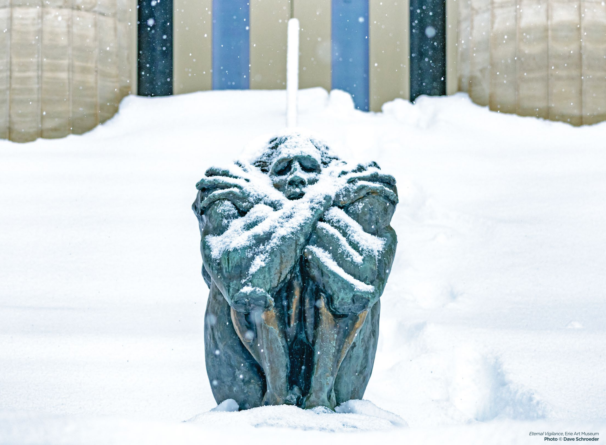
Eternal Vigilance, Erie Art Museum

Don't know who to call at City Hall? Citizen Response Center: (814) 870-1111