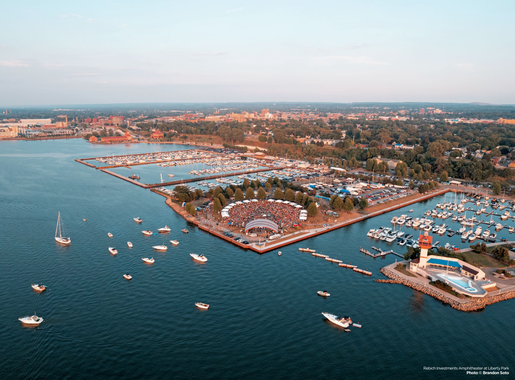
Rebich Investments Amphitheater at Liberty Park

Don't know who to call at City Hall? Citizen Response Center: (814) 870-1111