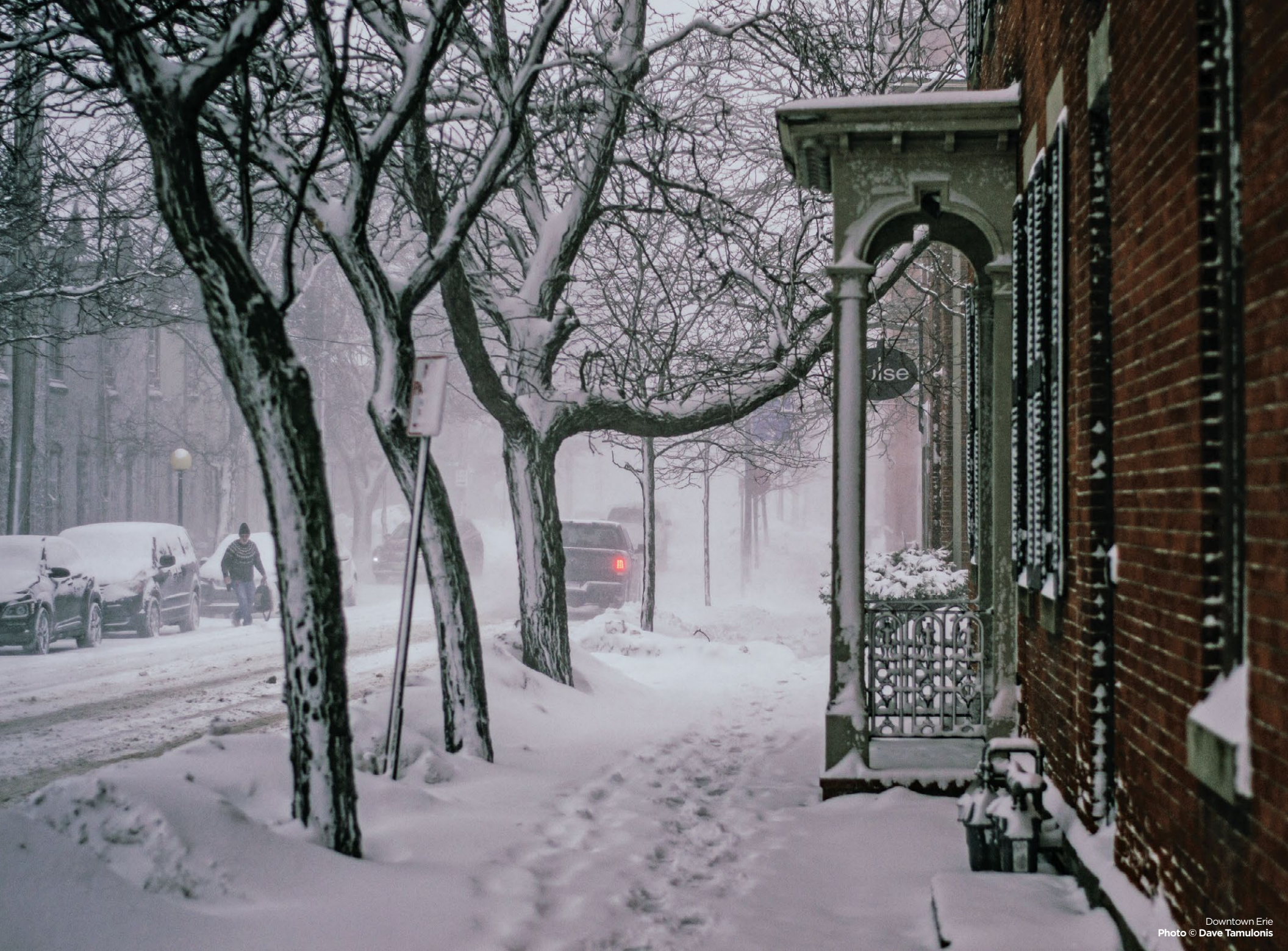
Downtown Erie

Don't know who to call at City Hall? Citizen Response Center: (814) 870-1111