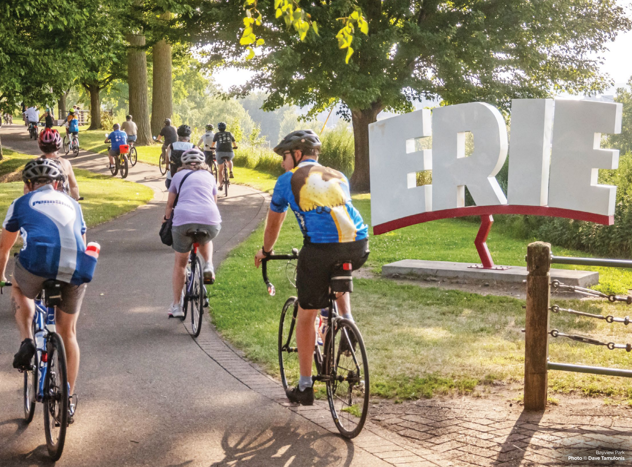
Bayview Park

Don't know who to call at City Hall? Citizen Response Center: (814) 870-1111