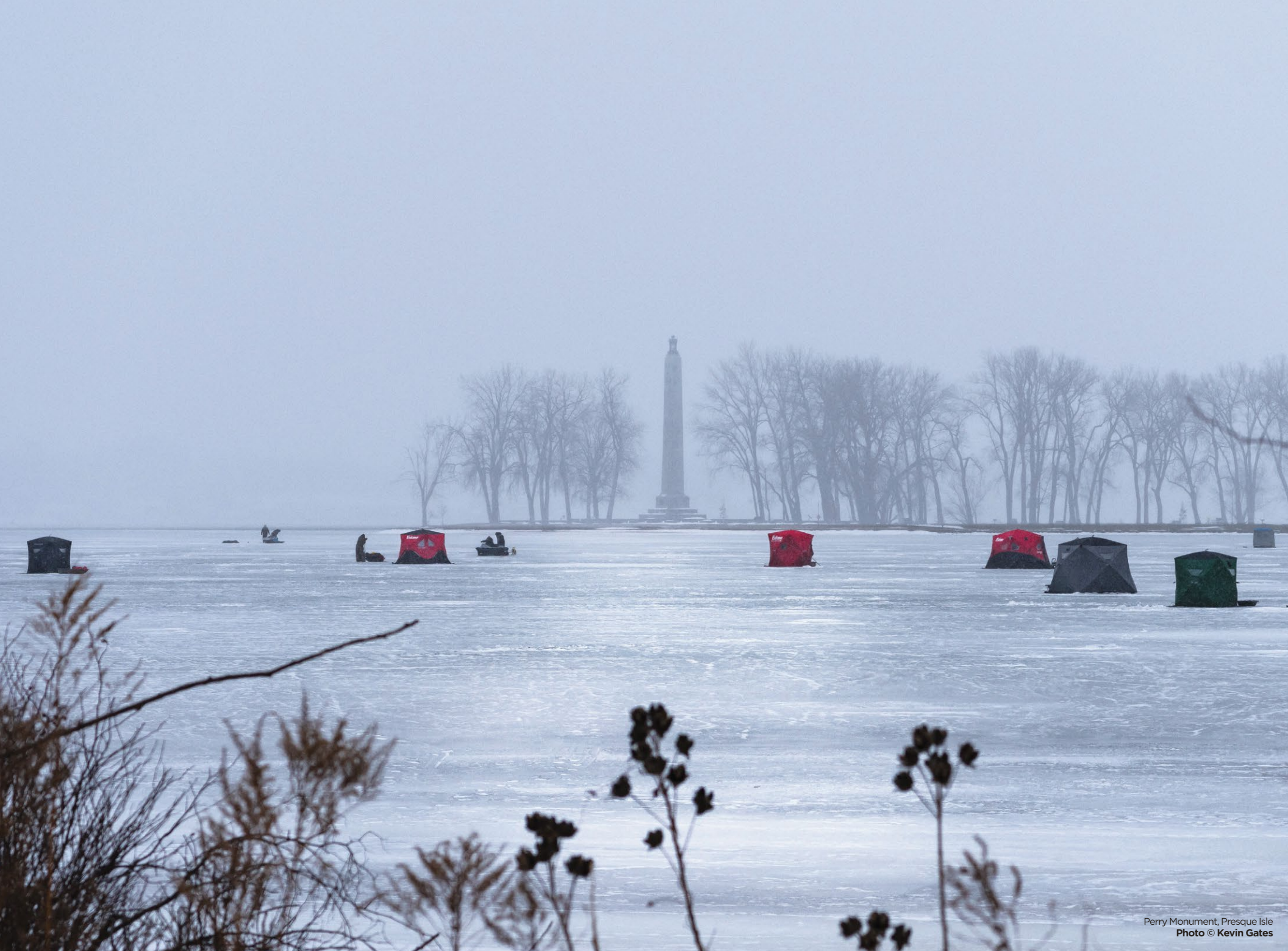
Perry Monument, Presque Isle

Don't know who to call at City Hall? Citizen Response Center: (814) 870-1111