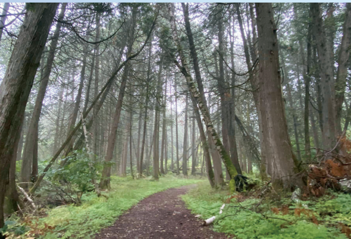
EXTENSIVE NATURE TRAIL SYSTEM