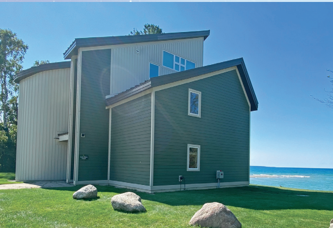
ON SITE RENTAL HOUSES