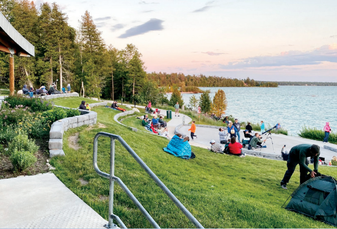
STARGAZING AT THE AMPHITHEATER