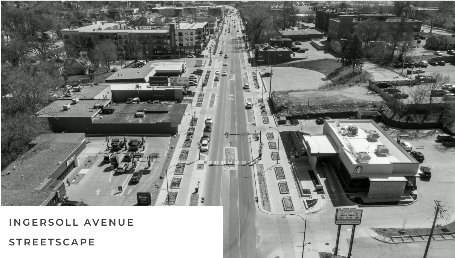
INGERSOLL AVENUE STREETSCAPE

The Des Moines Vision Zero Transportation Safety Action will embrace principles and strategies to take a different approach to traffic safety. The goal is to implement strategies to eliminate all traffic fatalities and severe injuries by 2040, while increasing safe, healthy, equitable mobility for all. Fundamental principles of the approaches known as Vision Zero and Safe Systems will be utilized in the Transportation Safety Plan.