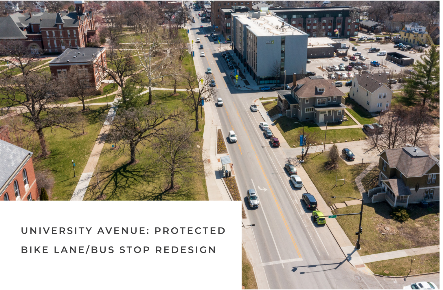
UNIVERSITY AVENUE: PROTECTED BIKE LANE/BUS STOP REDESIGN