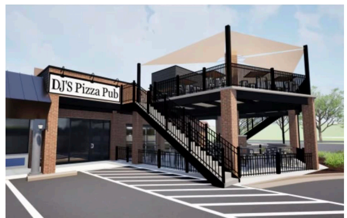
Rendered Image of DJ's Pizza

A new Mexican restaurant offering elevated, modern cuisine with creative fusion, sit-down dining, and a full bar is set to open at 4676 32nd Avenue in July.