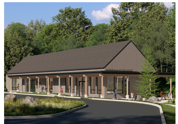
Rendered Image of ODC

This project is still in its early stages of development but for more information about this project please visit www.hudsonville.org/ODC .