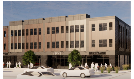
Terra Station Rendering

141-unit, twelve-building mixed-use development, commercial building under construction, listed as one of Crain's Grand Rapids Business 'Top Residential Projects of 2025.' Estimated project completion is in the fall of 2026, with the commercial buildings opening in the fall of 2025.