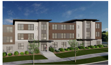
Prospect Flats Rendering

A 41-unit, two-building rental housing development, north of Prospect Street and west of 32nd Avenue opening in May 2025. Leasing opportunities are available.