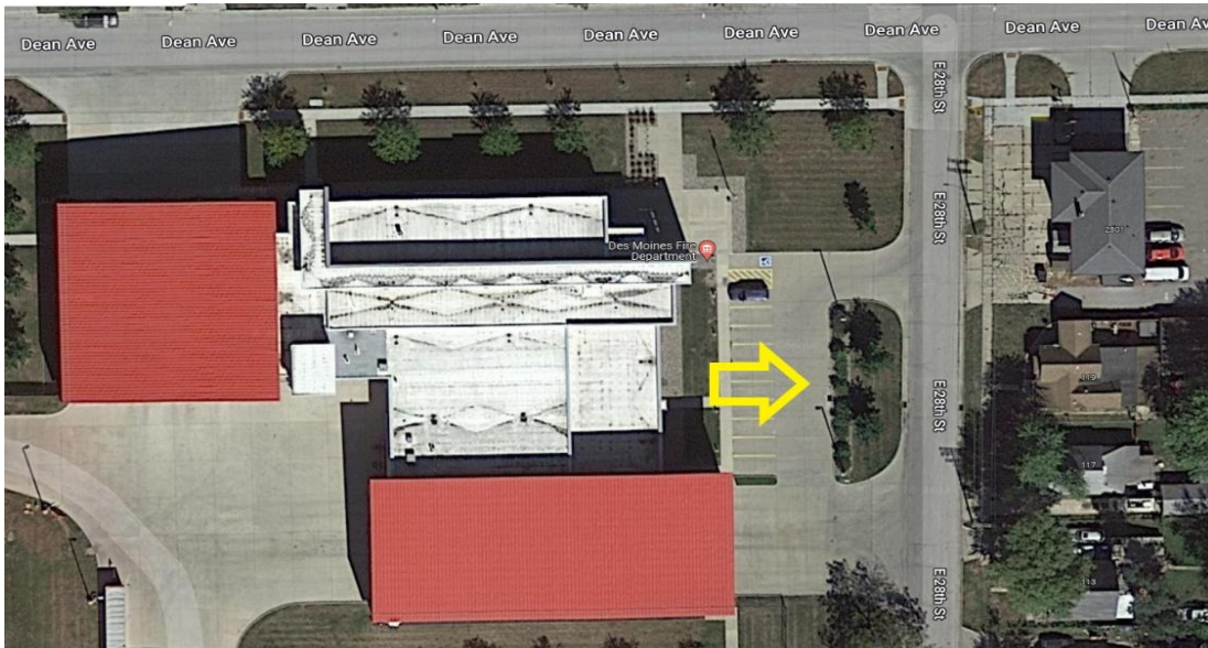
Satellite view of 2715 Dean Ave, Des Moines IA 50317