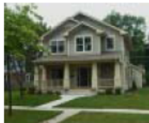
Property to Right 1 Address