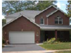
Property Across 3 Address