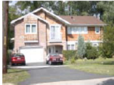
Property Across 2 Address