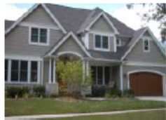
Property Across 1 Address