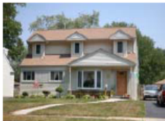
Subject Property Address