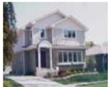
Property to Left 2 Address