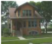
Property to Left 1 Address