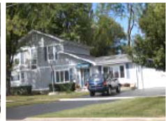
Property to Right 3 Address