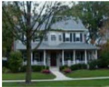
Property to Left 3 Address