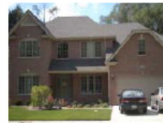
Property to Right 2 Address