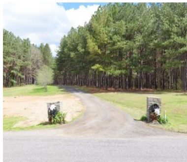
CCC Pylons on N. Lodore Road