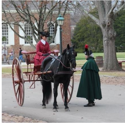
Scene from today’s Colonial Williamsburg

informative works on local Revolutionary era history, locales, and personages; and to complement, where feasible, local, area, and state efforts to promote tourism and associated economic development. The overall effort will involve a pluralistic and pragmatic cross-section of public interests, while edifying diverse communities in the facts, resultants, and ideals of the American Revolution. The committee so far has reached out to local educators, libraries, museums, civic service and veterans organizations, businesses, media entities, county staffers, and colleges.