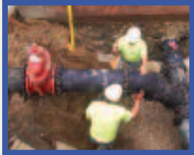
2006 water main construction in the Akron service area.

The Akron Public Utilities Bureau strives to deliver water which is clear and odorless with acceptable taste even though these qualities are not generally related to health concerns. Your water may occasionally